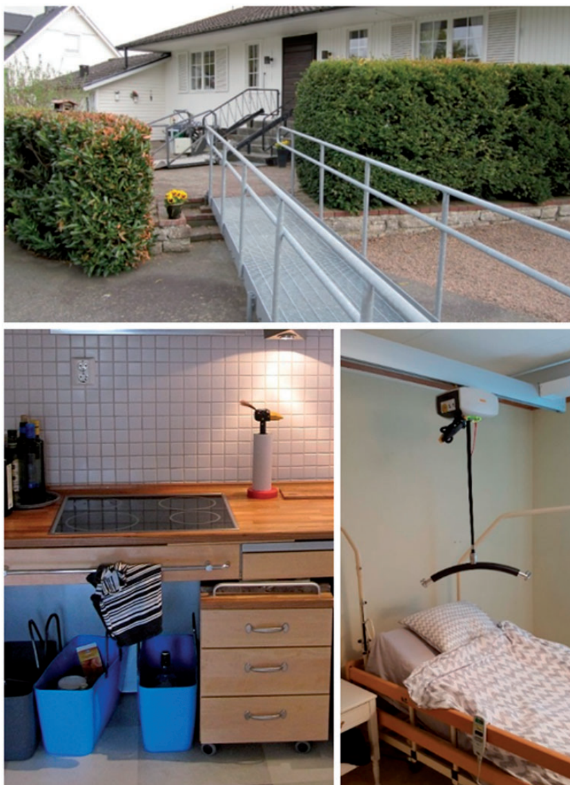
Figure 1. The three most common housing adaptations.

Note: the three most common housing adaptations are marked in bold.